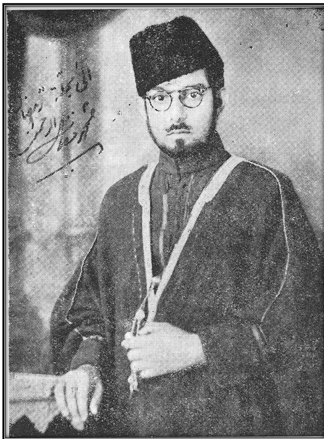
Dr. Muhammad Fazlur Rahman Ansari in 1943